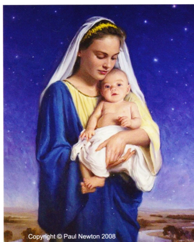
Tri-Parish Pro-Life Ministry Battle Creek, Michigan prolifeministrybc@yahoo.com